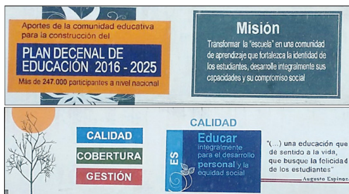
Figure 1. Street graffiti with governmental propaganda.