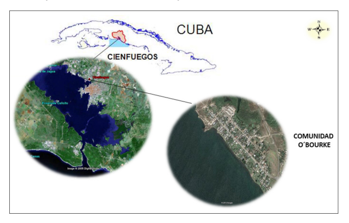
Figure 1. Location of the O'bourke community

The community has a population of 936 inhabitants, 500 men and 436 women, distributed among 300 families according to data provided by the Primary Public Health Care System in the community.