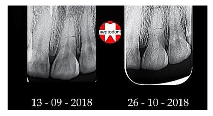
Figure 3. Control X-ray: 1 year and 1 month