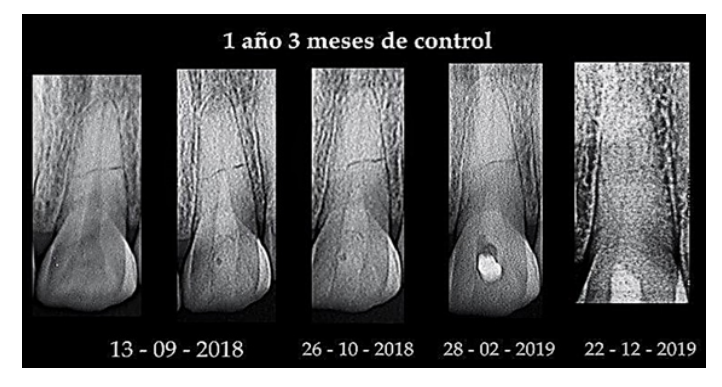
Figure 4. Control X-ray: 1 year and 3 months