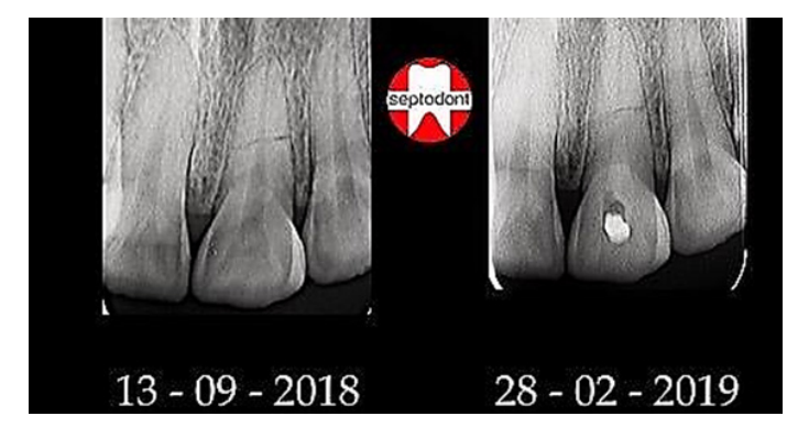
Figure 2. Control X-ray: 5 months and 15 days